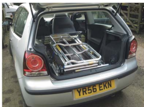
or in a VW Polo