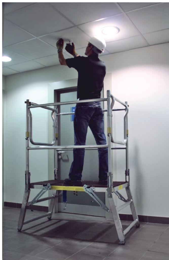
Figure 1: The DeltaDeck® access platform

Load tests were carried out in the most onerous configuration of maximum leg extension and lowest angle setting.