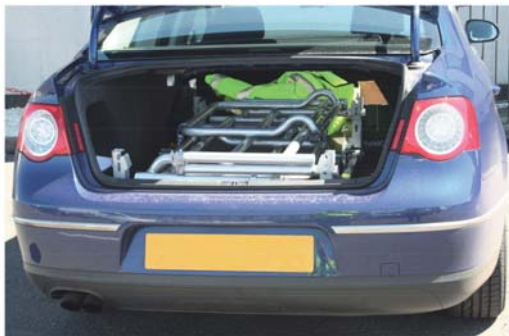
in a VW Passat

In 2007, the DeltaDeck® won the Health & Safety Category of the "Professional Builder Magazine" Awards. The Professional Builder Magazine is the business magazine for builders, plumbers and timber merchants providing practical and informative articles on subjects that matter to professional builders merchants.